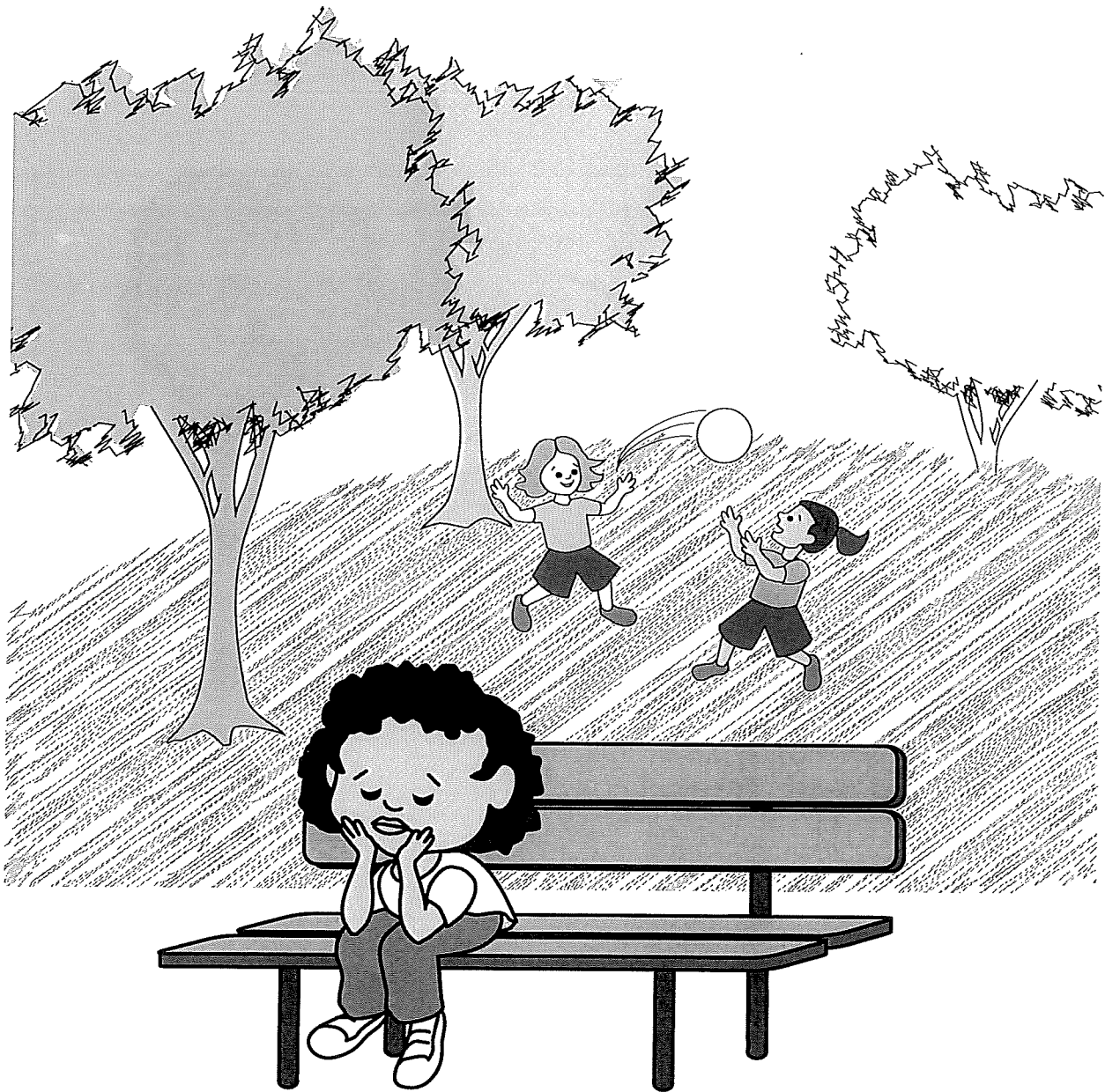
Loss of interest in usual activities (i.e., constriction of play)