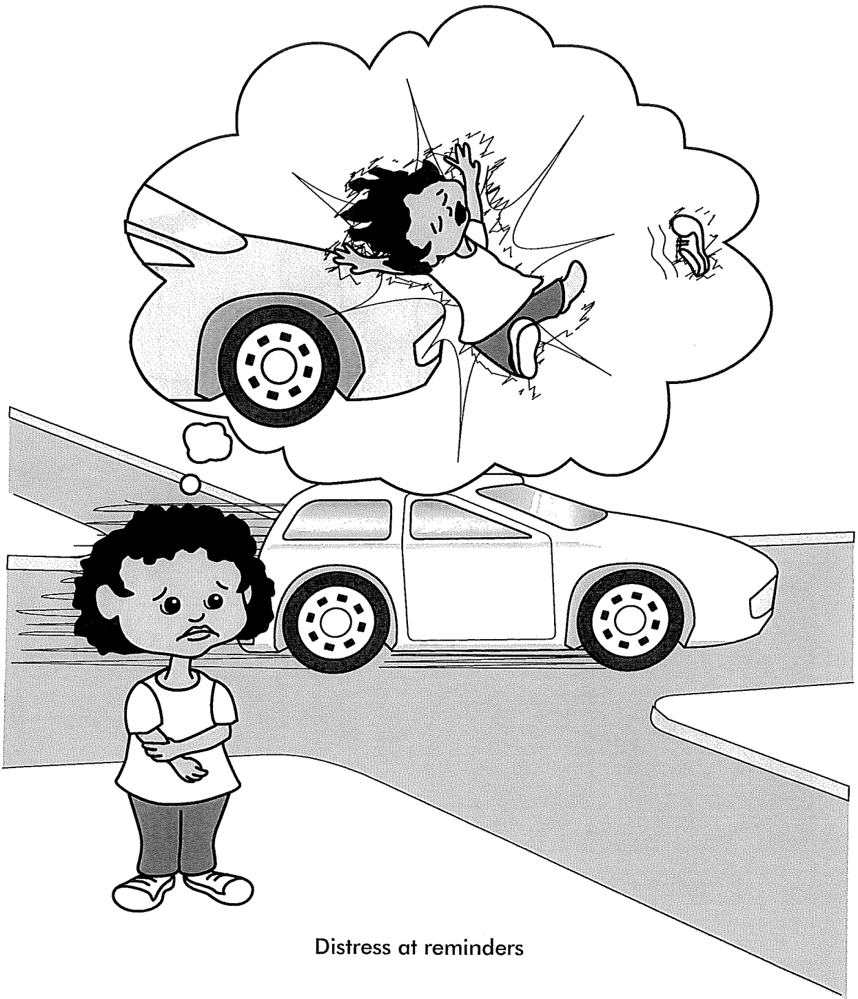
Distress at reminders