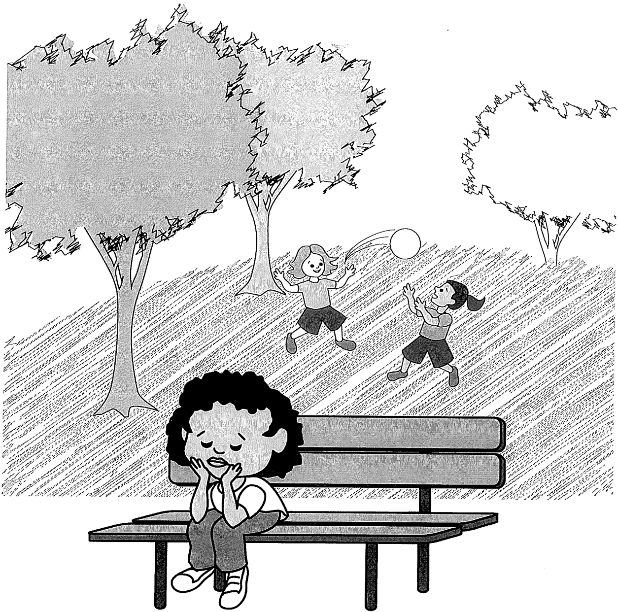
Loss of interest in usual activities (i.e., constriction of play)