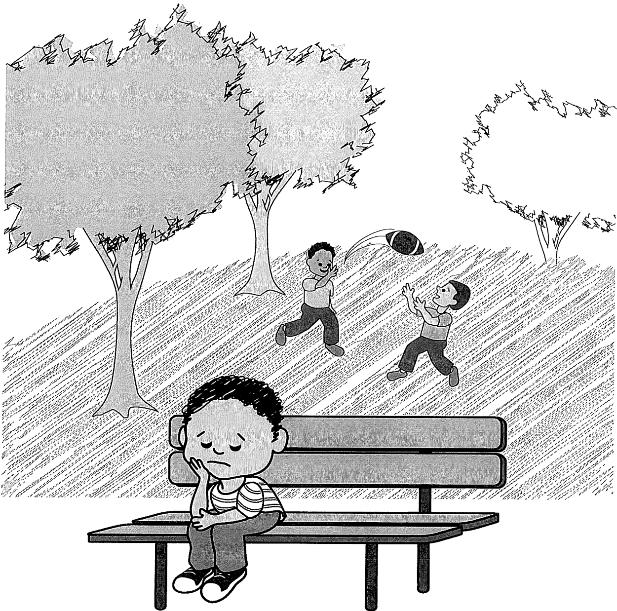
Loss of interest in usual activities (i.e., constriction of play)