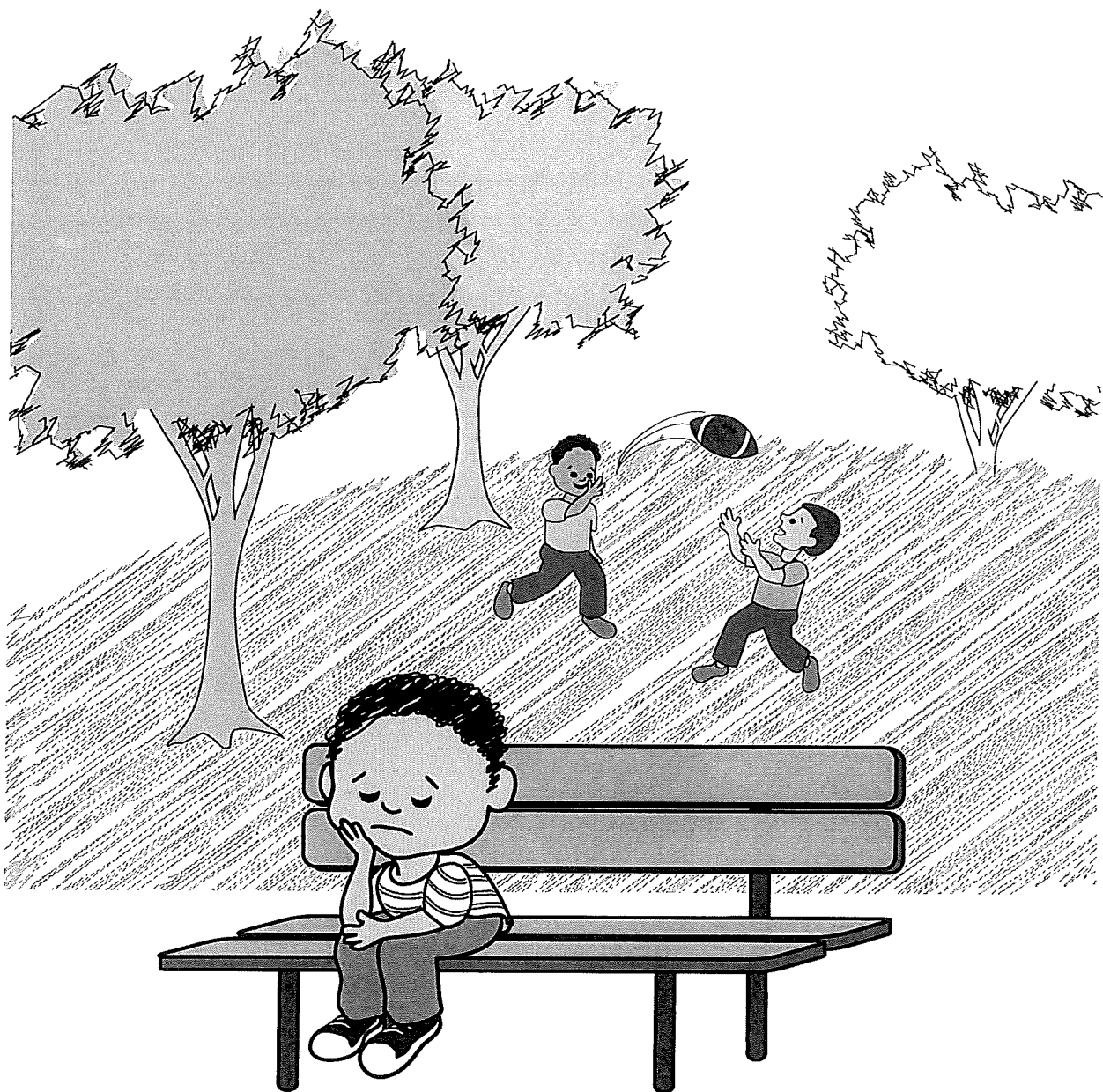
Loss of interest in usual activities (i.e., constriction of play)