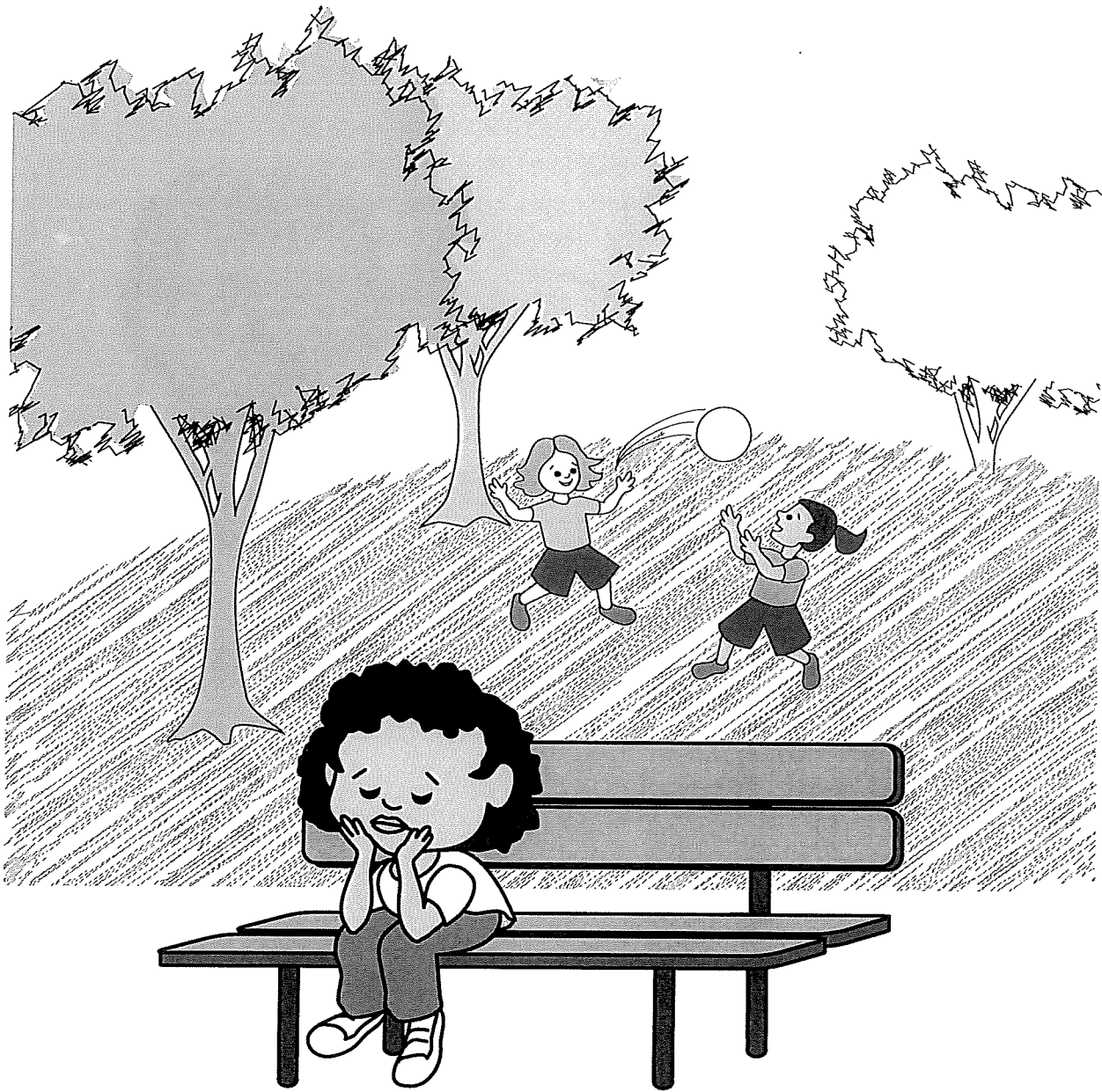
Loss of interest in usual activities (i.e., constriction of play)