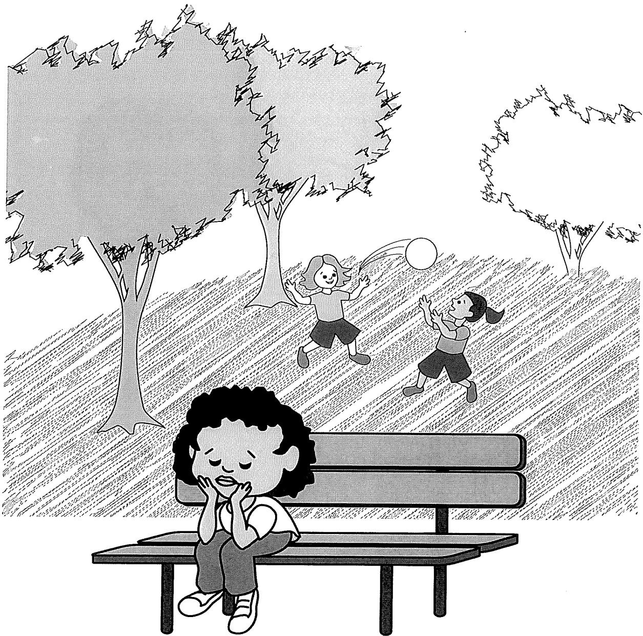
Loss of interest in usual activities (i.e., constriction of play)