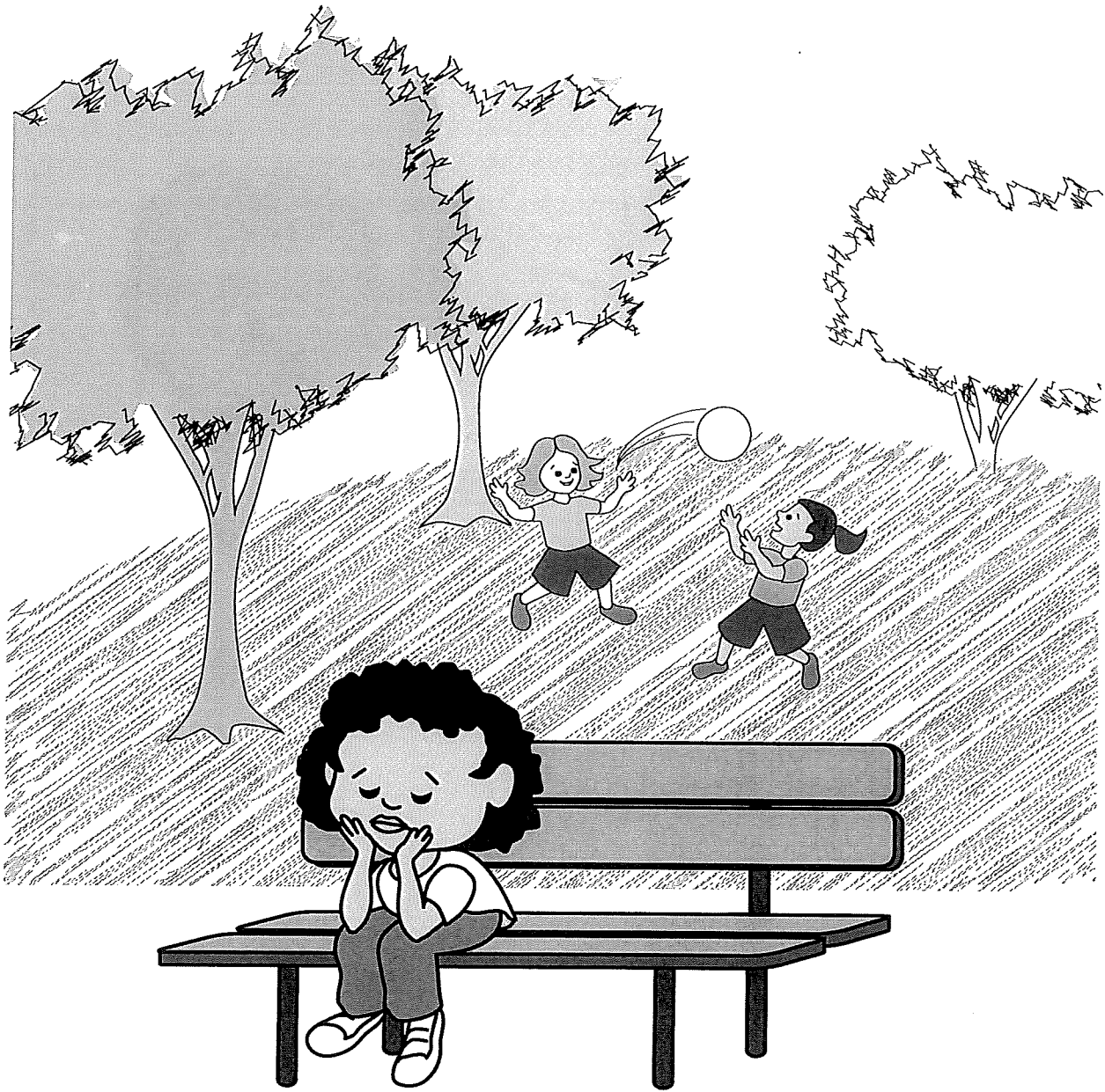
Loss of interest in usual activities (i.e., constriction of play)